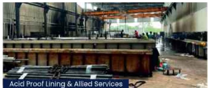
Acid Proof Lining & Allied Services

For detailed product information and our complete range of offerings, please visit our website at : polytechprojects.com