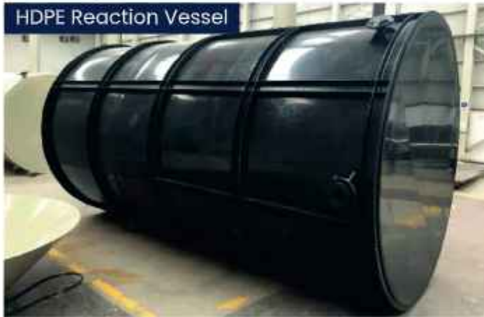
HDPE Reaction Vessel