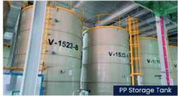
PP Storage Tank