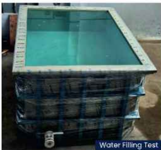
Water Filling Test

"Our mission is to deliver superior, tailored solutions across diverse industry sectors, upholding the highest standards of safety, quality, and ethical conduct while nurturing enduring partnerships and ensuring client satisfaction in every endeavour."