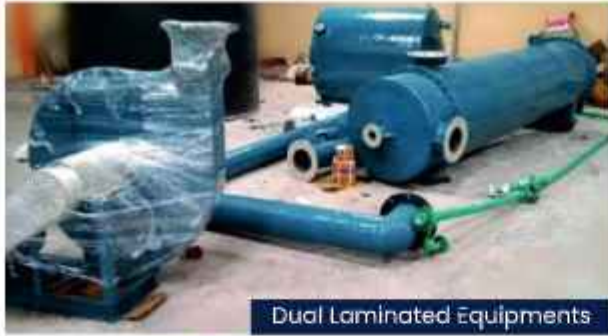
Dual Laminated Equipments